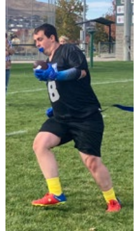
West Plains Football