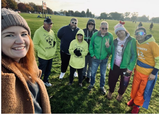
Tri-Cities * Hanford Howl Ultimate Frisbee Event